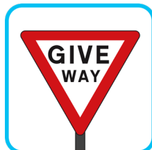
Give Way Sign