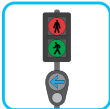
Traffic Light Pedestrian Crossing

On a family drive how many of these can you find?