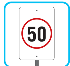
Speed Limit Sign