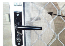
Perspex lock protector

A security door should be measured to ensure a tight fit.