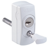
Multi purpose bolt