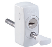
Multi purpose bolt