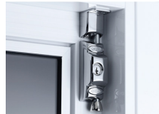
Patio door bolt