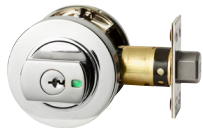
Double-cylinder deadbolt is operated by a key on both sides of the door

A key-in knob lock should be supported by the addition of a double-cylinder deadbolt. One key should operate both locks.