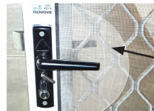
Perspex lock protector

A security door should be measured to ensure a tight fit.