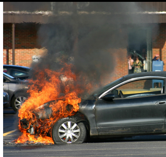
EQUIPMENT & VEHICLE MAINTENANCE

Visit the South Australia Police website: police.sa.gov.au for more bushfire prevention fact sheets and information.